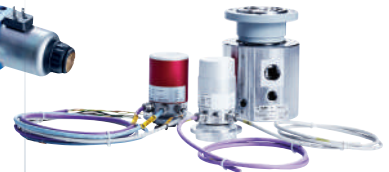
Rotary unions & slip rings